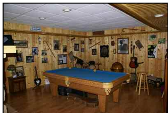
Easter 08 046