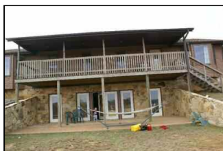
Easter 08 051