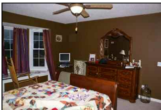
House 2008 090