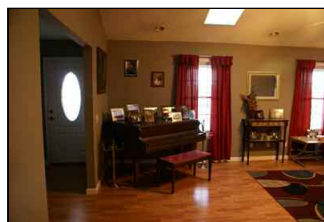
Easter 08 038