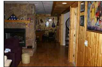
House 2008 054