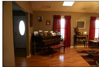
Easter 08 038