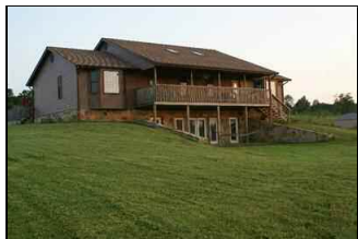
House 2008 012