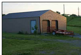
House 2008 007