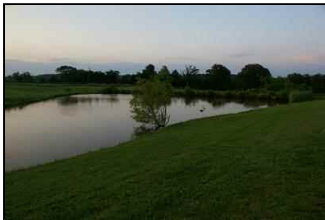
House 2008 009