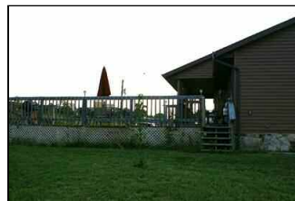
House 2008 025