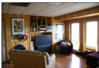
Easter 08 045