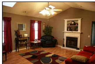
Easter 08 037