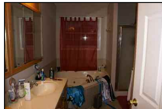
House 2008 083