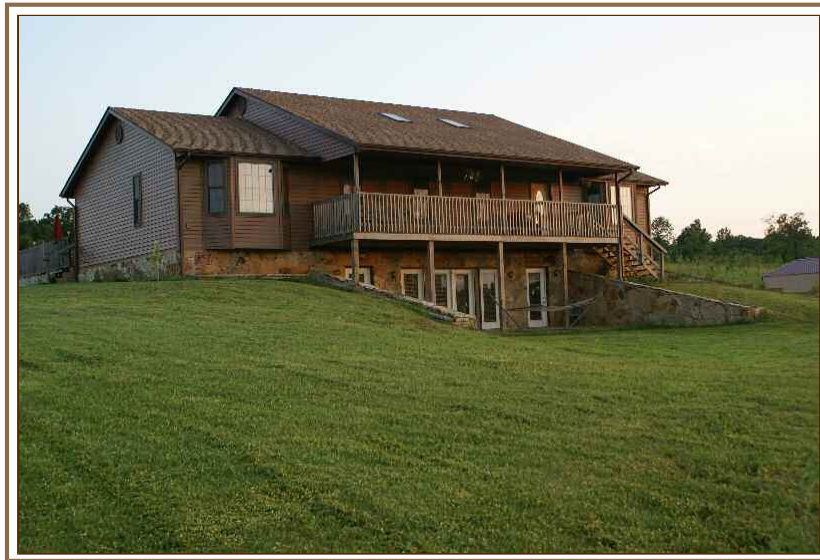
Spacious Home - 7 Acres - Pond