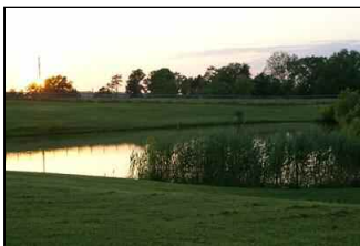
House 2008 021