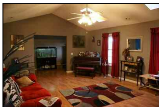
Easter 08 036