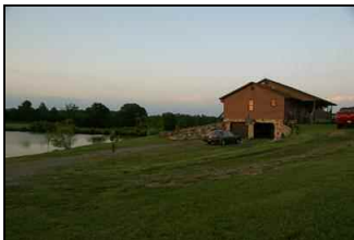
House 2008 034