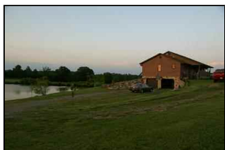
House 2008 034