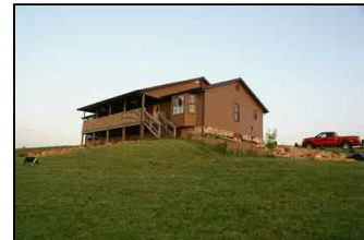
House 2008 010