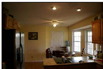
Easter 08 039