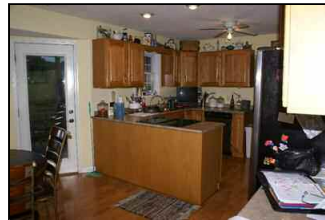
House 2008 063