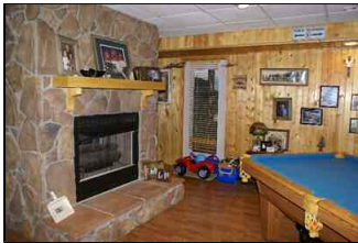
House 2008 059