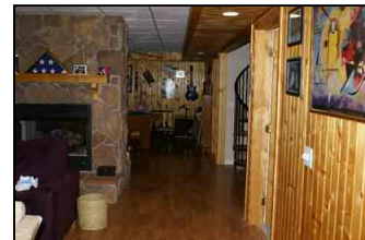
House 2008 054