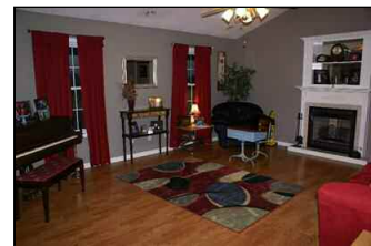
House 2008 075