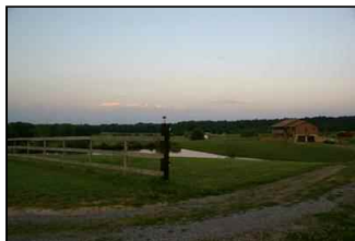
House 2008 037