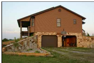
House 2008 008